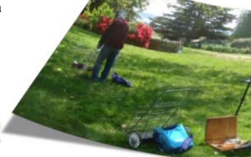
The true meaning of life is to plant trees, under whose shade you do not expect to sit. ~ Nelson Henderson