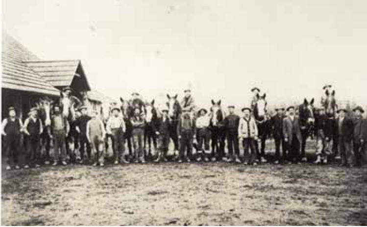
Clearing Team, Dominion Experimental Farm, 1912

An invitation to all (members, neighbours, friends, relatives) who have memories and anecdotes of the Dominion Experimental Farm and Park during its 100 year history.