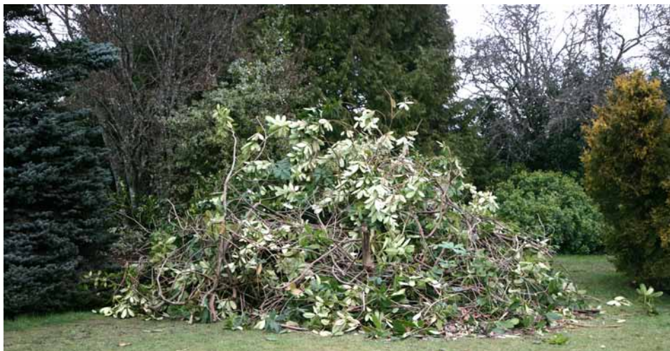
A mountain of pruning debris awaits our intrepid volunteers.