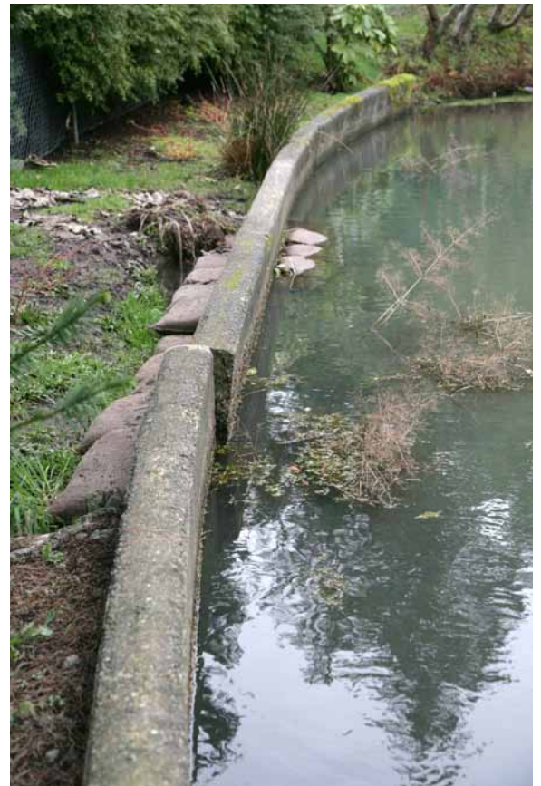
Oops, we sprung a leak !

It is a long list for our volunteers which they always tackle with enthusiasm. However, a few extra hands would be most welcome by us all. Think 'fun and satisfaction' for a Wednesday morning activity.