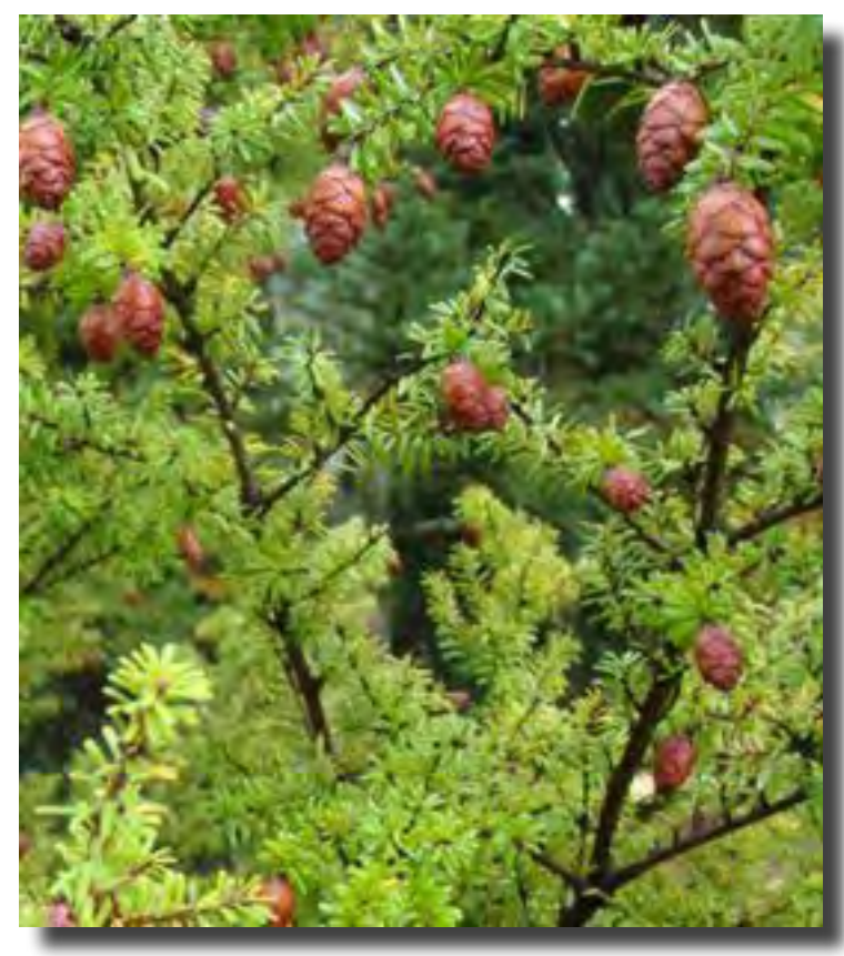
Tusga Sieboldii (Japanese Hemlock)

We have added to Sam's Garden , Pinus aristata (dwarf bristlecone pine), Rhodo Monarch Horizon, Pinus densiflora 'Umbraculifera' (Sciadopitys Verticillata,