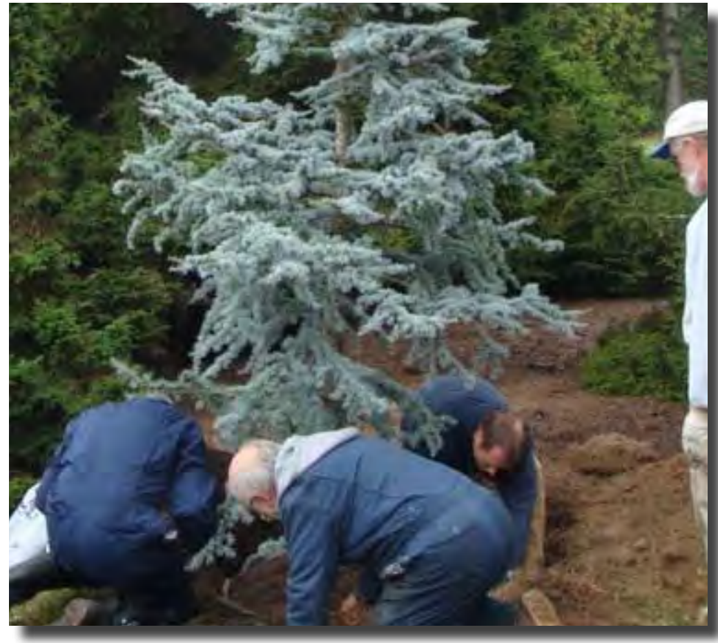
Cedrus atlantica Glauca planting

The 2009 Wednesday morning work session is closed. It has been a wonderfully productive year for the Park and its stalwart volunteers. We have logged just over 700 hours even with four work days cancelled and the results are evident.